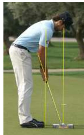
Proper setup with eyes over the ball.

The trunk and the head should not be moving during the putt. If the putter is too long, we often see compensational movements during the stroke. To check for head movements a second person is standing in front of the player and touches his forehead with the fingertip. During the putt it can now be easily inspected if the head is moved left/right, or if the balance is falling to the back or the front. The efficiency of potential fixes can be tested accordingly.