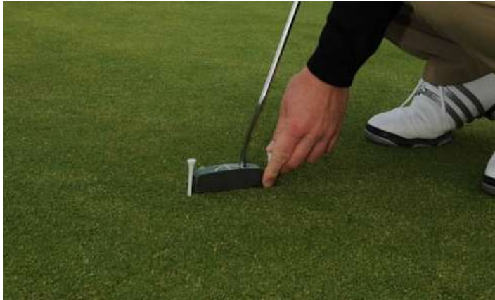
Sweet spot gate

Because of the limited speed of the eye movements it is impossible to clearly identify the impact spot with the naked eye. But it is pretty simple to create accurate feedback of the impact spot by using two tees. The tees are positioned symmetric left and right of the ball to act as a narrow gate for the putter. The ball is then positioned exactly in front of the sweet spot of the putter. If now a normal putt is hit, the gate provides feedback of the putter position at impact. If the putter touches a tee, then the path deviates to this side at impact. The narrower the tee gate is the more accurate you need to be.